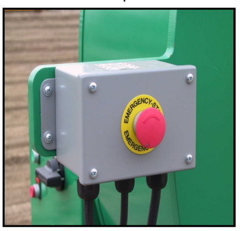
Emergency stops at several locations.

Changeover from one size to another is accomplished easily with adjustable thumbwheel stops.