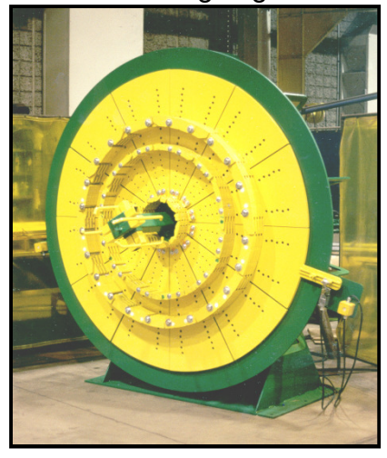
3 SIZES: 12" to 36" Pipe Dia. 12" to 48" Pipe Dia. 12" to 66" Pipe Dia.

Flat spots are eliminated through the use of curved shoe segments with interlocking fingers